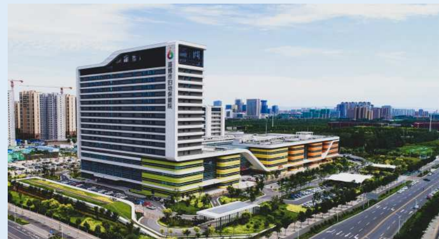
The New Campus

Zibo Maternal and Child Health Care Hospital (The Third People's Hospital of Zibo, Zibo Women and Children's Hospital) is located in Zhangdian District, Zibo. It was established in 1962. The hospital was approved as a 3-A-Class maternal and child health care specialized hospital integrating medical treatment, health care, teaching, scientific research, prevention and rehabilitation. The hospital has 1000 beds, 1616 employees. The New Campus covers an area of 183,100 square meters. The Xingyuan Campus covers an area of 41,000 square meters. The annual outpatient volume of the hospital is more than 1.1 million. 37,000 patients were discharged from hospitals. The highest number of births per year is nearly 10,000.