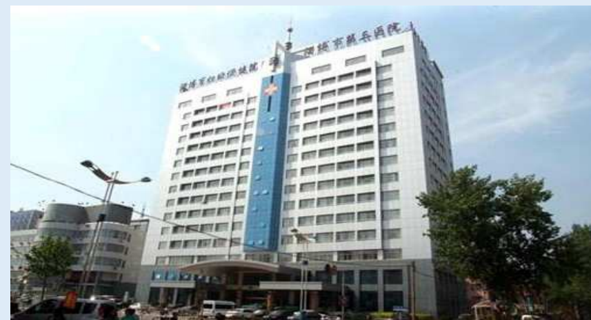
The Xingyuan Campus