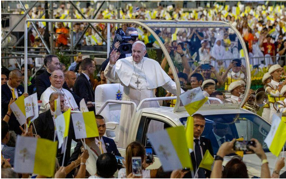
Photo: Pope Francis arrives at the National Stadium for the Holy Mass on 21 November 2019, with the Archbishop of Bangkok, H.E. Francis Xavier Cardinal Kriengsak Kovithavanij, seated behind him

----- H.E. Francis Xavier Cardinal Kriengsak Kovithavanij received his Masters Degree, the Licentiate of Spirituality from the Pontifical Gregorian University in Rome, Italy. He was consecrated as Bishop of Nakhon Sawan on 2 June 2007 and installed as Archbishop of Bangkok on 16 August 2009. His positions at the Catholic Bishop's Conference of Thailand from 2009 to the present include President of the Episcopal Commissions for Pastoral Care of the Christians and President of the Catholic Commissions for Liturgy. In addition, Cardinal Kriengsak is a member of the Pontifical Committee for International Eucharistic Congresses.