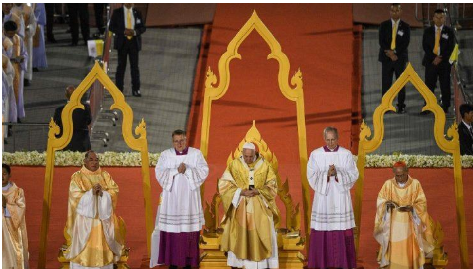
Photo: Pope Francis celebrating his first public mass at the National Stadium in Bangkok in November 2019