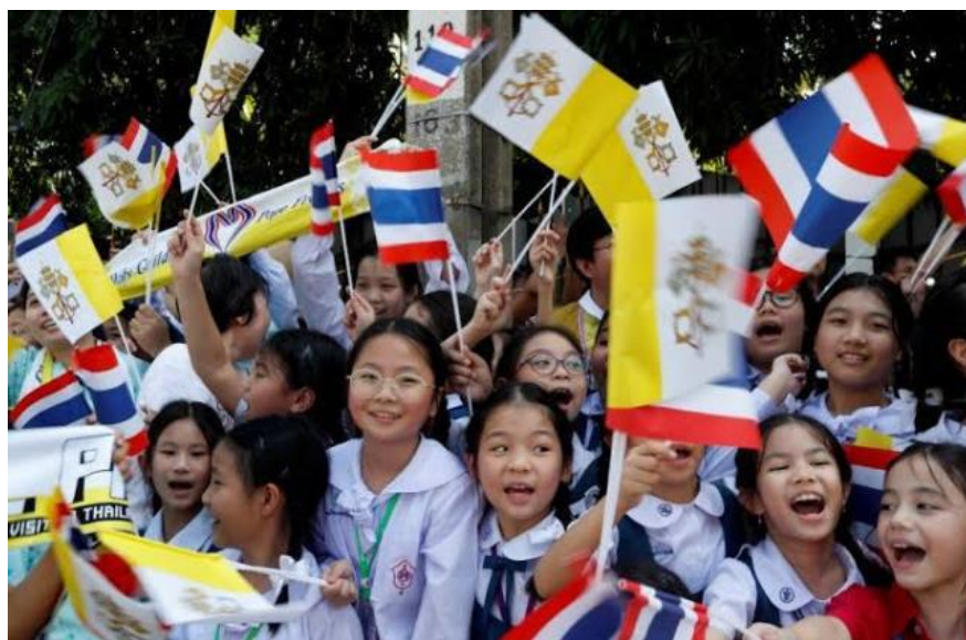
Photo: Thai Catholics gather to welcome the arrival of Pope Francis in Bangkok, November 2019

Almost four decades later, the meeting between the present King and Queen and Pope Francis echoes not only the close bond of friendship cultivated over centuries between Thailand and the Vatican, but also speaks volumes about the monarch's pivotal role as a unifying force and an upholder of all religions in the promotion of interfaith harmony and peaceful coexistence in Thai society.