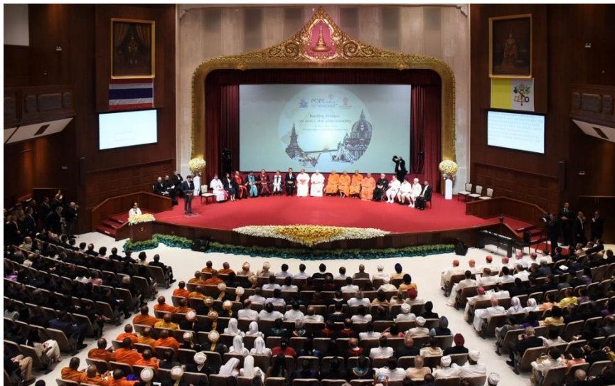
Photo: Pope Francis meets with priests and representatives of different religions at Chulalongkorn University Auditorium (Source: Ministry of Foreign Affairs of Thailand website: https://mfa.go.th )

Thailand would not be where it is today if the monarchy did not serve as a pillar of strength and a guiding light, leading by example and wielding incomparable moral authority. The generosity, thoughtfulness and embracing of diversity extended from the sovereign have shaped the nation and countless lives. Following their monarchs, Thais have adopted a mentality of openness and mindfulness of the differences among faiths and religions, and most importantly, a profound respect for those differences. The actions of the monarchy have indeed forged connections, furthered interreligious understanding and demonstrated that, regardless of what faith we hold, we are bound together by goodwill and shared values of kindness and respect.