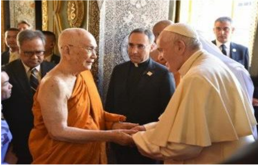
Photo: Pope Francis meets with Somdet Phra Ariyavongsagatayana, Supreme Patriarch of Thailand, at Wat Ratchabophit Sathitmahasimaram (Source: Ministry of Foreign Affairs of Thailand website: https://mfa.go.th )