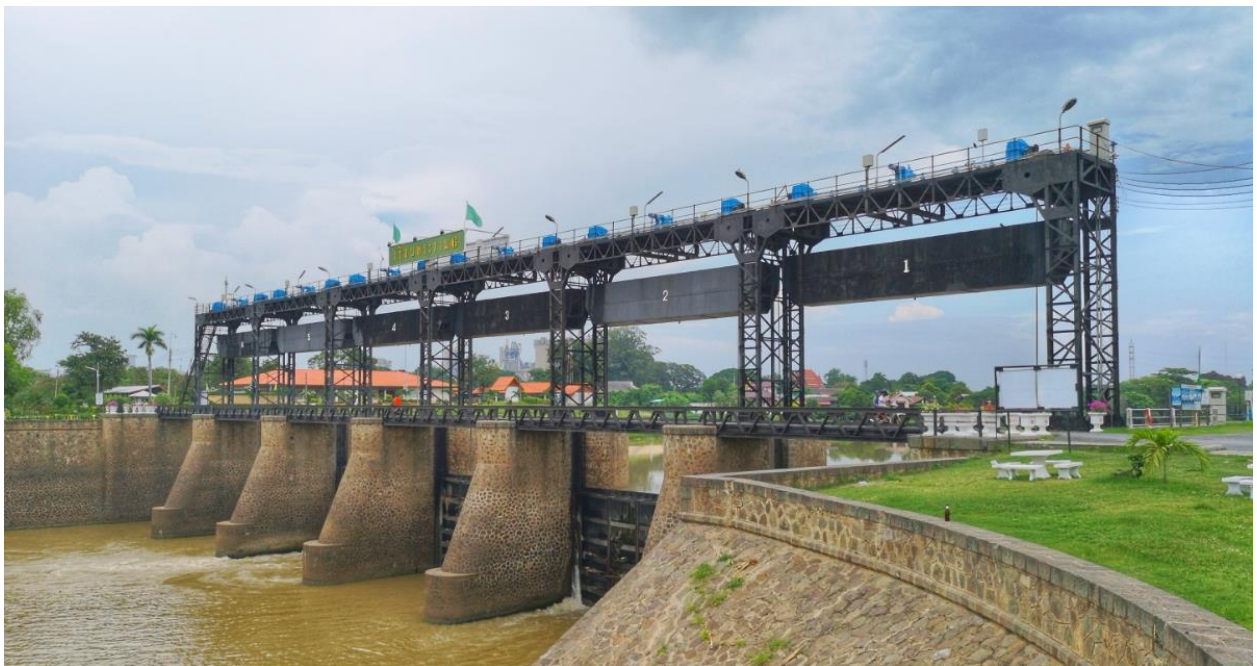
Photo: Rama VI Barrage/Dam, which began construction in late 1915 and was completed in December 1924. Its function is to supply water to 680,000 Rai of agricultural land in every part of the Rangsit canal area.

Prior to 1857, it was about managing people to suit the water conditions – either moving people away from or closer to water sources. The conclusion of the Bowring Treaty in 1855 led to demands for rice exports that required enough water for irrigation. Therefore, King Mongkut focused on developing canal systems in the Chao Phraya river delta for both irrigation and transportation. King Chulalongkorn, or Rama V, followed suit by upgrading them into more systematic irrigation and drainage systems, which led to the establishment of the Canals Department in 1902. Under King Vajiravudh, the Canals Department became the Barrages Department in 1914, as it expanded its work to construct the first large-scale barrage across the Pasak River in Ayutthaya, named the Rama VI Barrage.