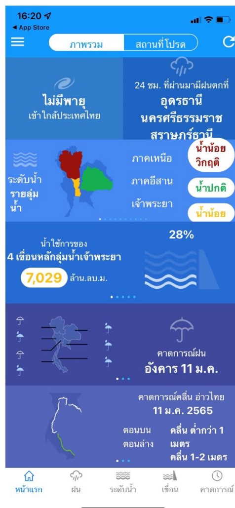
Photo: (from left to right) Automated Telemetry Station in Pongyeang sub-district, Mae Rim District, Chiang Mai Province and interface of ThaiWater mobile-application that has been integrated for general use.

To this day, the lifeline of the people continues to occupy an important place in the work of the Thai monarchy, as out of 4,877 Royal Development Projects, nearly 70% of them, or 3,386, are water resource development projects.