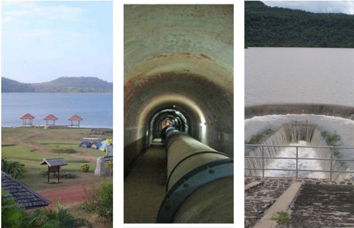
Photo: (from left to right) Huai Pai Reservoir in Mukdahan, water delivery system, and Lam Payang Reservoir in Kalasin.