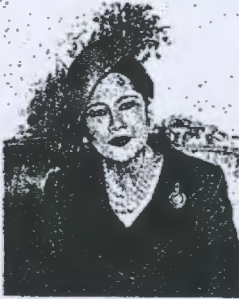
Queen Sirikit of the Kingdom of Thailand

“W hatever makes the populace happy; that makes me happy also.” is Her Majesty Queen Sirikit's motto that all Thais and myself remember. Not only has her speech enlightened our day and reassured us of her warmth and compassion extended to her subjects, but her actions have also remained the living proof that she meant what she said.