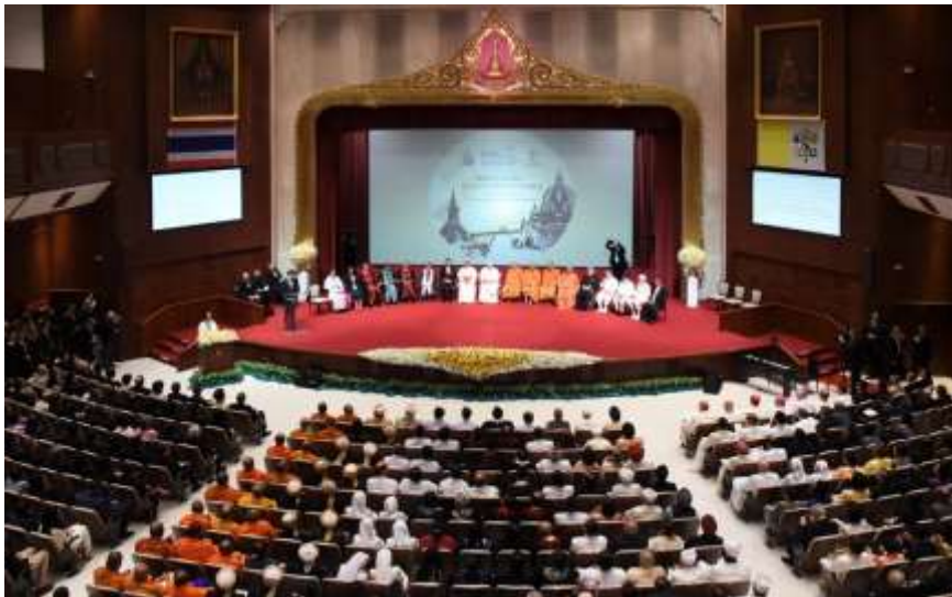
Photo: Pope Francis meets with priests and representatives of different religions at Chulalongkorn University Auditorium

Thailand would not be where it is today if the monarchy did not serve as a pillar of strength and a guiding light, leading by example and wielding incomparable moral authority. The generosity, thoughtfulness and embracing of diversity extended from the sovereign have shaped the nation and countless lives. Following their monarchs, Thais have adopted a mentality of openness and mindfulness of the differences among faiths and religions, and most importantly, a profound respect for those differences. The actions of the monarchy have indeed forged connections, furthered interreligious understanding and demonstrated that, regardless of what faith we hold, we are bound together by goodwill and shared values of kindness and respect.