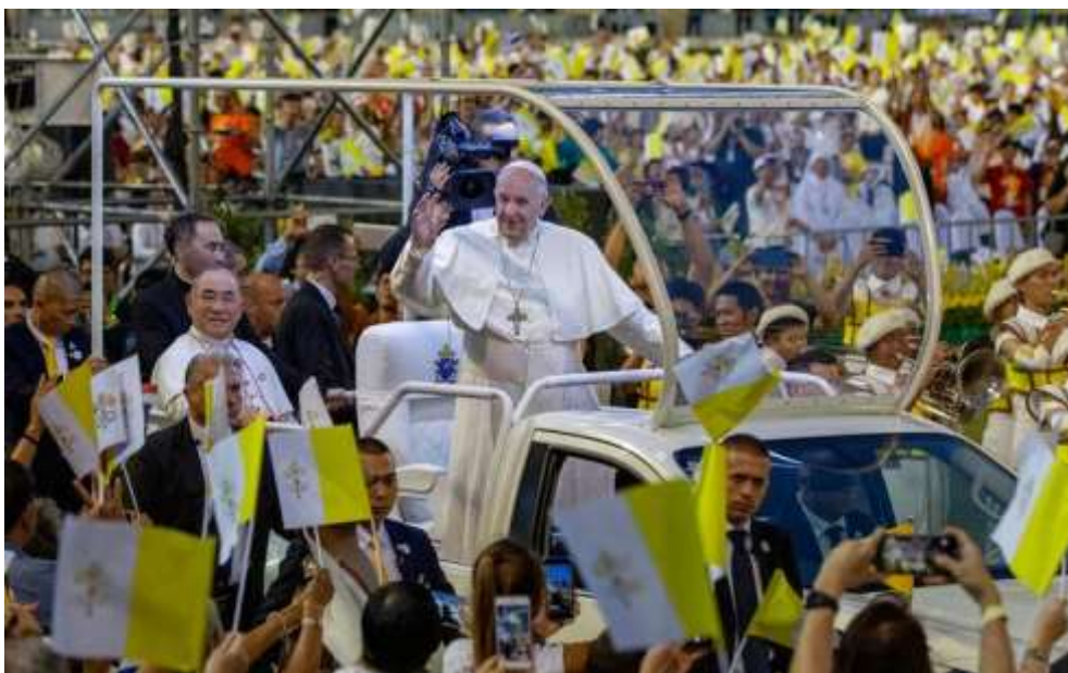
Photo: Pope Francis arrives at the National Stadium for the Holy Mass on 21 November 2019, with the Archbishop of Bangkok, H.E. Francis Xavier Cardinal Kriengsak Kovithavanij, seated behind him