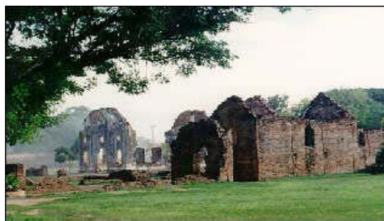
The ruins of a once grand palace nestled among the trees.

Our first destination will be the Lopburi National Museum, or Narai Rajaniwet Palace. This palace was formerly the residence of King Narai the Great, who reigned during the Ayutthaya period. It has also accommodated foreign ambassadors.