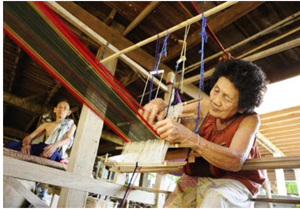
Ban Hat Siew in Sukhothai province, Northern Thailand: a Tai Phuan woman meticulously patterning a “Pha Sinh Teen Chok,” a kind of sarong for ceremonial use.