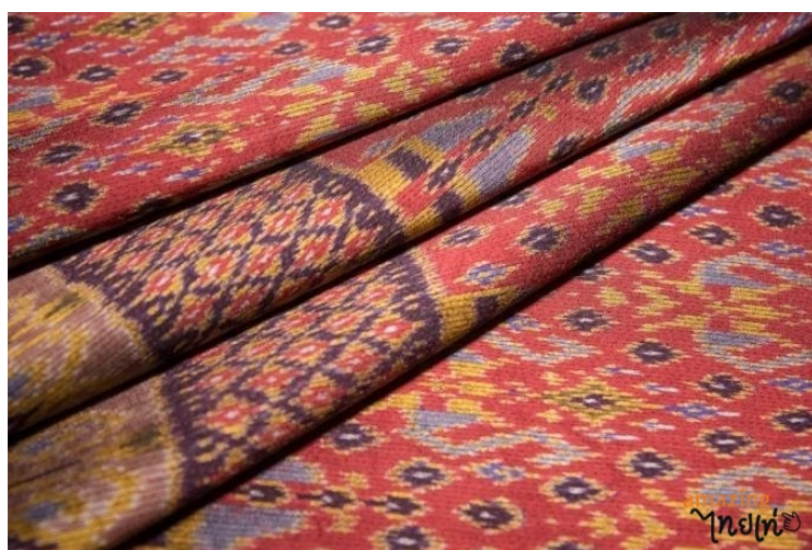
Examples of local mudmee from Baan Hua Fai Village.

Over the years, Baan Hua Fai has grown to be a village cooperative of almost 200 members, most of them women. Today, it has become a model OTOP enterprise that welcomes visitors and serves as a learning and collaborative center for design and production techniques. Younger generations are adopting new business models according to changing tastes and the marketing environment. They sell products online via Facebook and Instagram, and collaborate with Thailand's top designers.