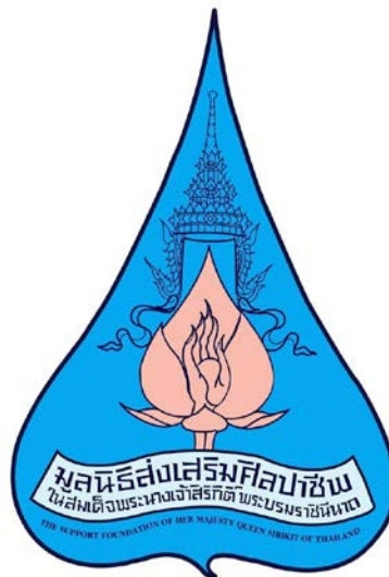
The SUPPORT Foundation of Her Majesty Queen Sirikit of Thailand

Her Majesty Queen Sirikit launched the SUPPORT Foundation to institutionalize the royal initiative to develop the cottage craft industries around the country. By providing an outlet for their products to reach the market, the SUPPORT Foundation played a crucial role in making sure the villagers actually had alternative means of income besides farming. As a result, a number of them started to develop the business of handloom fabrics in earnest.