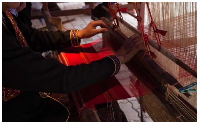
Ban Phon in Kalasin province, Northeastern Thailand: a Phu Tai woman weaving Phrae Wa silk in Kalasin.

The making of artisanal Thai fabrics is also closely associated with nature. For silks, villagers grow mulberry trees and harvest the leaves for feeding silkworms. Leftover waste from growing the silkworms then becomes good quality fertilizer. In contrast to chemical dyes, colors derived from natural sources such as indigo for blue, ebony seeds for grey and black, lac for red, are non-toxic, so they can be discarded without causing harmful pollution. Old traditional techniques therefore, continue to prove better for both the planet and the people.