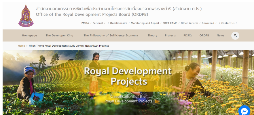
Office of the Royal Development Projects Board website

In 1993, the World Bank presented His Majesty with a specially-commissioned sculpture of a vetiver plant made of bronze, together with an Award of Recognition “for technical and development accomplishment in the promotion of vetiver technology internationally.” As a leader of research in vetiver grass, Thailand was chosen to host the first International Conference on Vetiver (ICV) in 1996 in collaboration with the World Bank and the FAO. Subsequently, the Pacific Rim Vetiver Network with Thailand at the core was established to serve 22 member countries of the Pacific Rim in order to disseminate information on the Vetiver System. To date, member countries have produced over 70,000 publications which are accessible through the website administered by the Office of the Royal Development Projects Board.