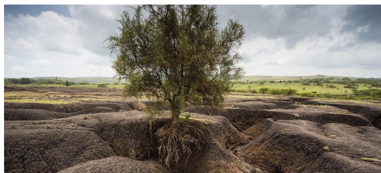
Soil erosion in the Tanzanian Maasai landscape

The rate at which soil is becoming degraded and depleted could very well turn it into the new black gold. While soil formation does occur in nature, the process is so slow that soil may as well be regarded as a non-renewable resource. Consider this – it takes up to 1,000 years to form one centimeter of top soil, but this one centimeter can be lost with just one heavy rainfall. It should not come as a surprise then, that the United Nations has been raising the alarm bells of an impending catastrophe. Ninety per cent of the Earth's precious topsoil is likely to be at risk by 2050. By that year, the impact of soil degradation could have already caused $23 trillion in losses of food, ecosystem services and income worldwide. These are staggering figures.