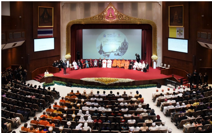
Photo: Pope Francis meets with priests and representatives of different religions at Chulalongkorn University Auditorium

Thailand would not be where it is today if the monarchy did not serve as a pillar of strength and a guiding light, leading by example and wielding incomparable moral authority. The generosity, thoughtfulness and embracing of diversity extended from the sovereign have shaped the nation and countless lives. Following their monarchs, Thais have adopted a mentality of openness and mindfulness of the differences among faiths and religions, and most importantly, a profound respect for those differences. The actions of the monarchy have indeed forged connections, furthered interreligious understanding and demonstrated that, regardless of what faith we hold, we are bound together by goodwill and shared values of kindness and respect.