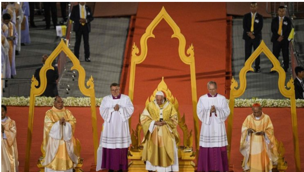
Photo: Pope Francis celebrating his first public mass at the National Stadium in Bangkok in November 2019