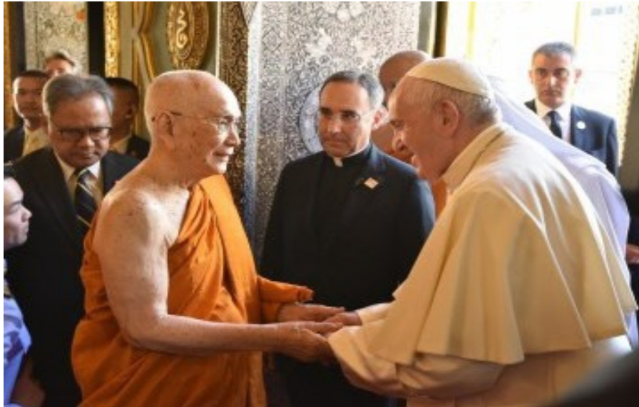
Photo: Pope Francis meets with Somdet Phra Ariyavongsagatayana, Supreme Patriarch of Thailand, at Wat Ratchabophit Sathitmahasimaram