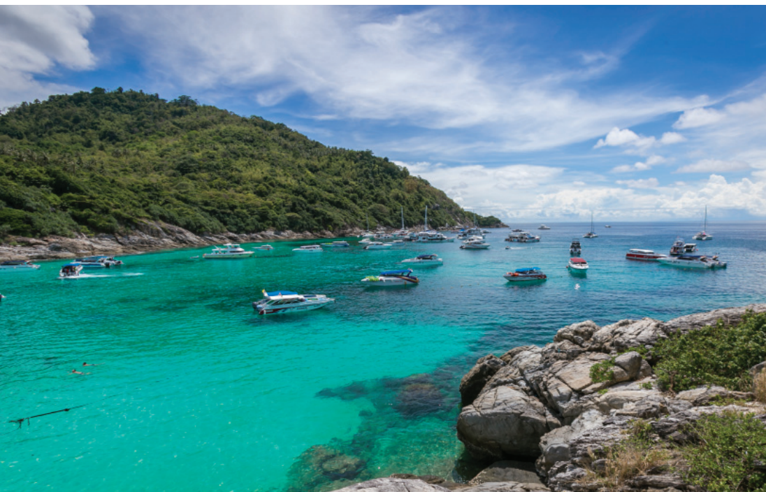
Ko Racha Yai