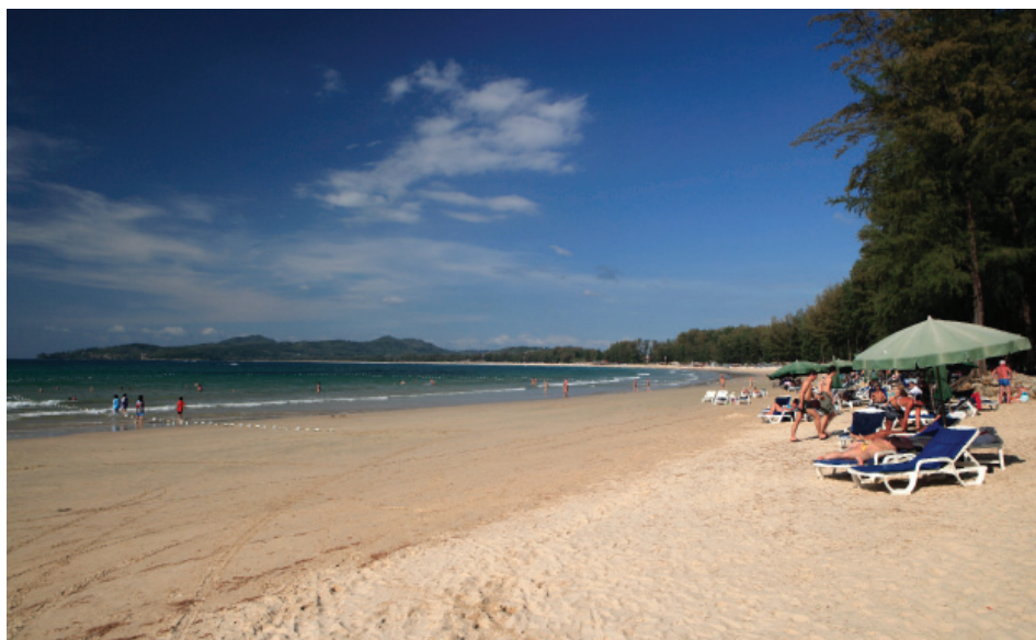
Hat Bang Thao

is a large open bay with one of Phuket's longest beaches. It was once used for tin mining, but has been developed into a luxury resort by the Laguna complex, a massive five-star hotel. The beach is quite steep with high waves; various watersports can be enjoyed. Plenty of places to eat, tour companies, and other tourist facilities are available.