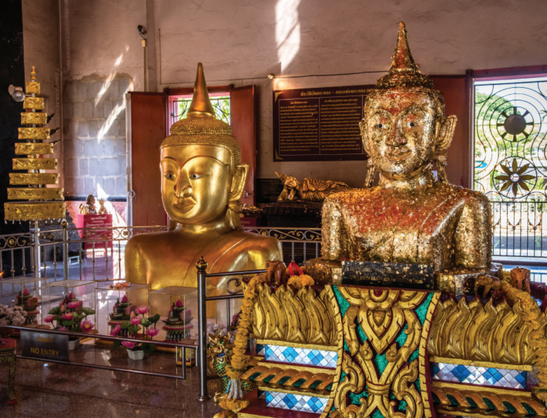
Wat Phra Thong

Namtok Ton Sai (น้ำตกตोनไทร) A small falls, over which pours a great volume of water during the rainy season. The trees, watercourses, and pools nearby provide one of Phuket's loveliest scenes. The park headquarters and a small restaurant with an excellent view are also at Ton Sai.