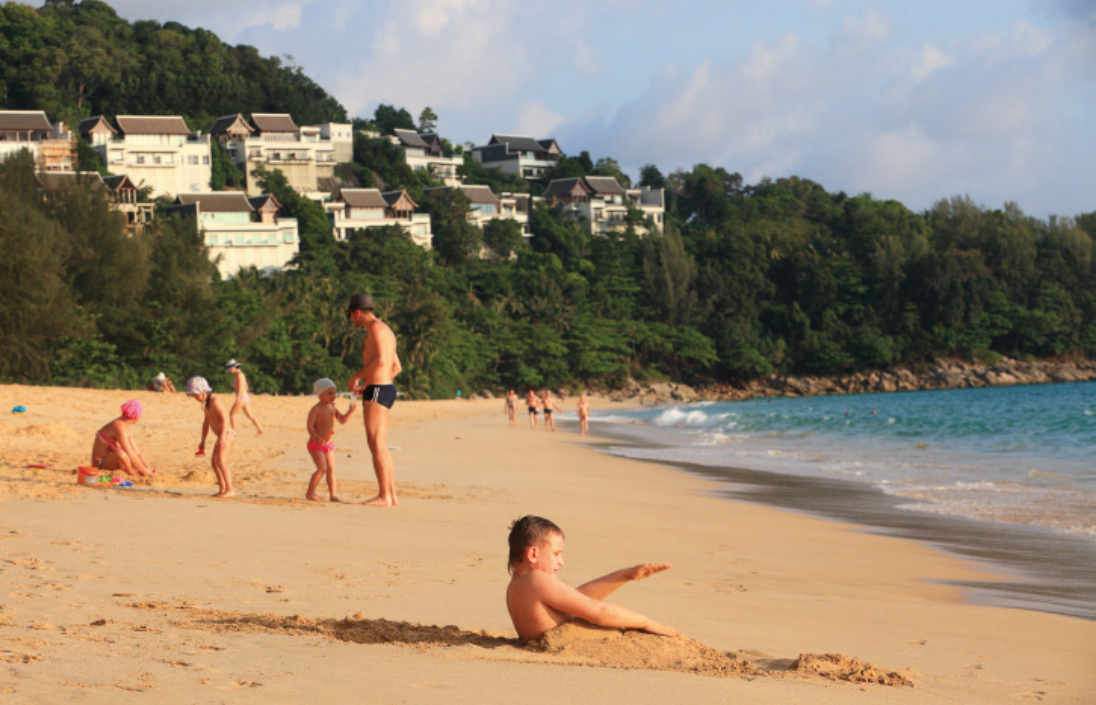
Hat Nai Yang