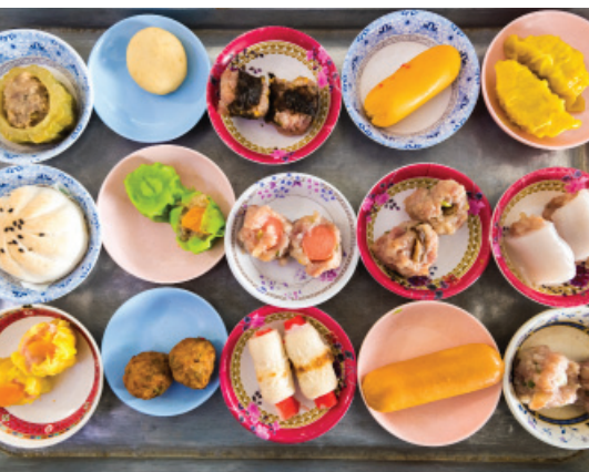
Phuket's Dim Sum