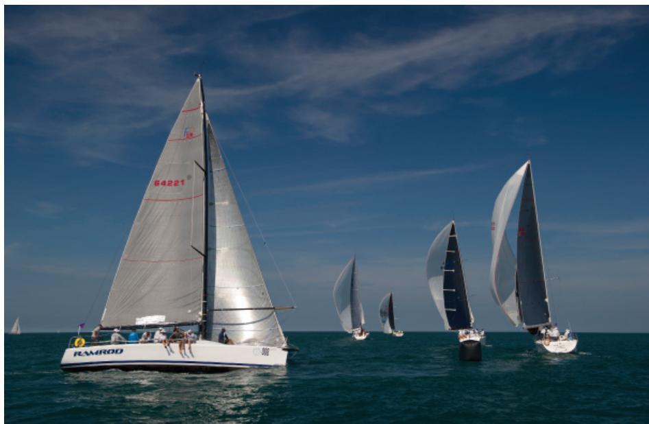
Phuket King's Cup Regatta

Chinese ancestry commit themselves to a 9-day vegetarian diet, a form of purification believed to help make the forthcoming year “trouble-free”. The Festival is marked by several ascetic displays, including fire-walking and ascending sharp-bladed ladders.