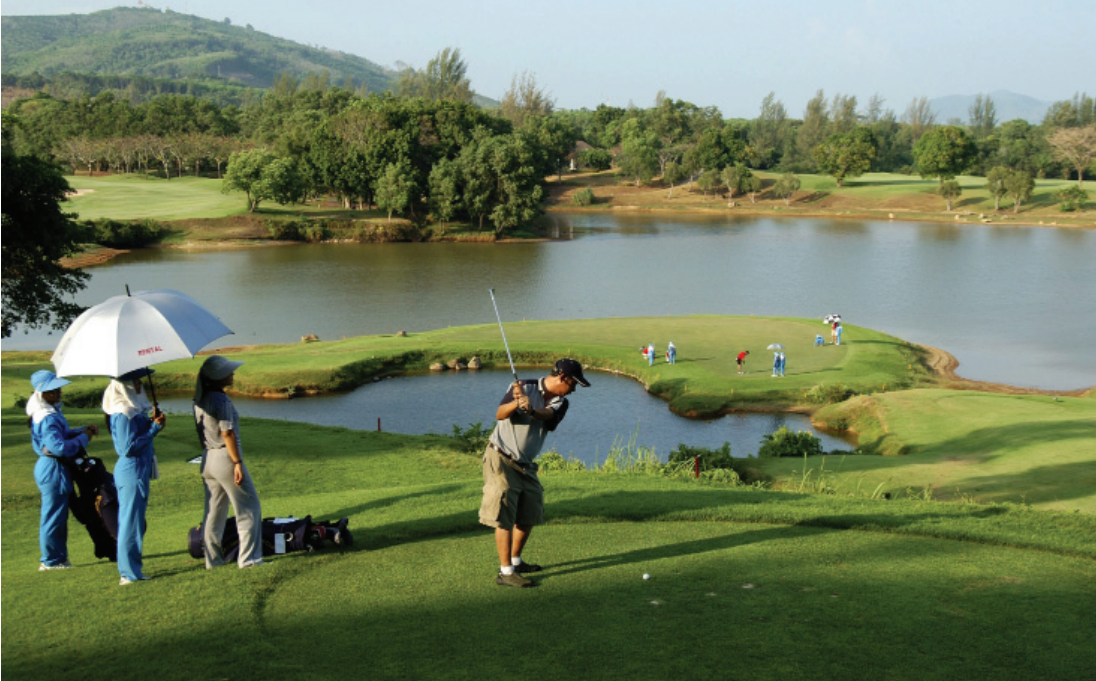
Blue Canyon Country Club

attracts global yachting entrepreneurs and showcases Thailand's competitiveness as a high-end marine lifestyle centre by focusing on the yachtsmen in the upper segment who have high-spending power. The event also promotes the superyacht charter business, tourism and marine-based activities in the new navigation route.