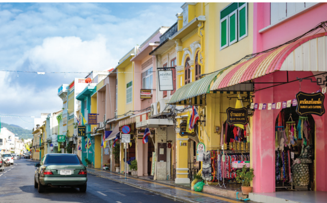
Sino-Portuguese building at Thanlang Road