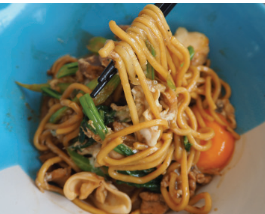
Fried or Boiled noodle Dishes