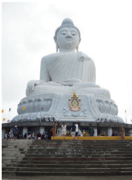
the Big Buddha, Wat Phra Yai

is located in Soi Luanpu Supha, Tambon Chalong, is a retrospective floating market that imitates the lifestyle, art and culture including