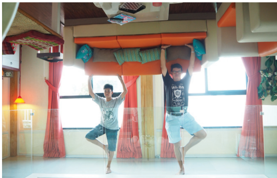
The Upside Down House