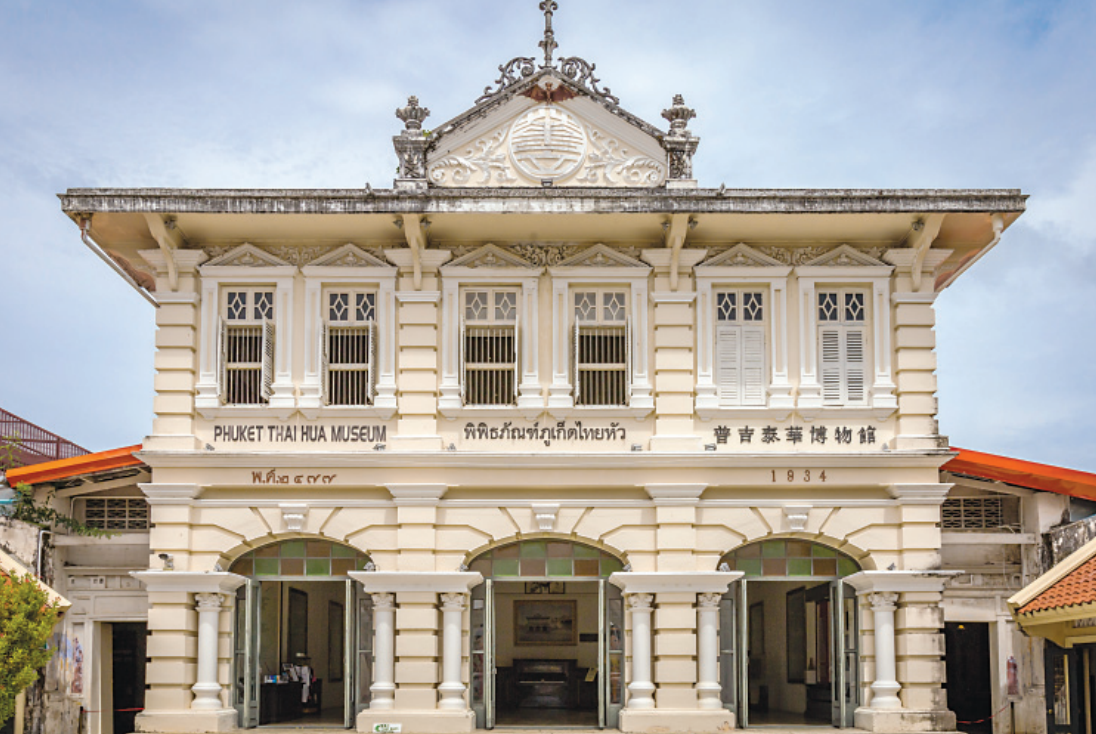
Phuket Thai Hua Museum

built during the time of Phraya Ratsadanupradit Mahisonphakdi (Khosimbi Na Ranong) serving as a royal commissioner of the Phuket Circle, who approved to have the first bank established. Later, the Treasury Office designated the Phuket Municipality to restore the bank as a museum. Situated at the Intersection of Phang-nga and Thepkasattri Roads, this old yellow building museum is open to be a learning centre of the way of life and art and culture of the Phuket people. On the ground floor is a hall displaying rotational exhibitions. On the second floor is a showcase of Peranakan Niyom telling the historical background and identity of the Peranakan people. It is open on Tuesday-Sunday (closed on Monday) during 9.00 a.m.-4.30 p.m. For more information, please call. Tel. 09 5257 7264, 09 5257 7342.