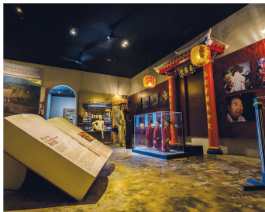
The inside of Phuket Thai Hua Museum

is held on Thalang Road in the Phuket Old Town amidst the atmosphere of the Sino-Portuguese architectural buildings decorated with beautiful lights in the twilight, is divided into two zones: the activity and local food zones. Visitors will enjoy experiencing the way of life and culture of the local people. Open only on Sunday during 4.00 p.m.-10.00 p.m.