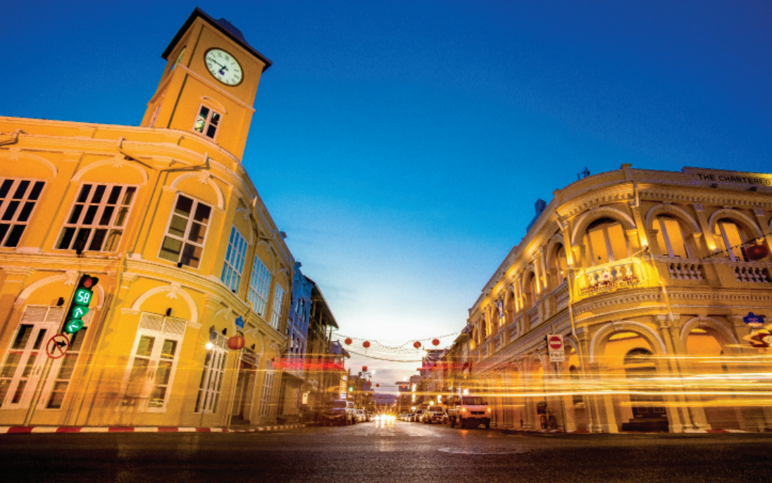
Sino-Portuguese building at Phang-nga Road