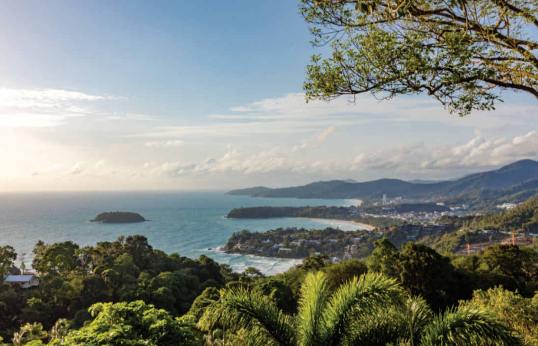
Karon View Point