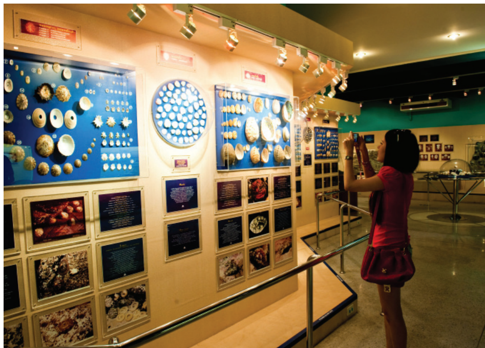
Phuket Seashell Museum

traditional Thai houses of the four regions. The Market is divided into different zones; such as, food stalls, handicrafts and OTOP stalls, and the activity zone replicating a funfair model; for example, balloon darts and other games. Open daily during 11.00 a.m.-7.30 p.m. on Monday-Thursday, and 11.00 a.m.-9.00 p.m. on Friday-Sunday. Admission fees: 200 Baht for adults and 100 Baht for children. For More information, please call Tel. 0 7660 7888 or visit www.thalangmaneeekram.com