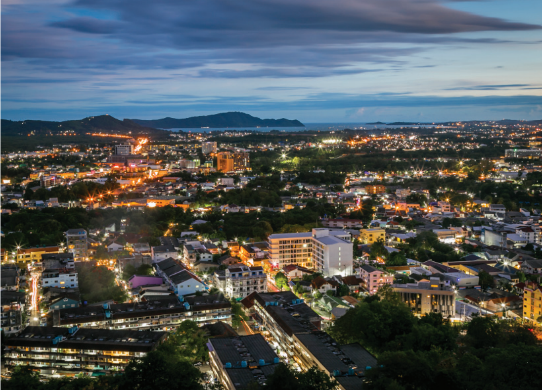
Khao Rang Viewpoint

Chao Le, can be found on Ko Si-re at Laem Tukkae. The muddy seabed means the island is not good for swimming. There are some popular seafood restaurants on the eastern shore.