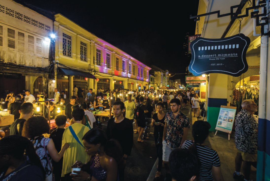
Lat Yai Phuket Walking Street

well preserved. The architectural style, typical of the region, is described as Sino-Portuguese and has a strongly Mediterranean character. Shops present a very narrow face onto the street but stretch back a long way. Some other old European-style buildings of note are the Phuket Thai Hua Museum, Peranakannitat Museum, etc.