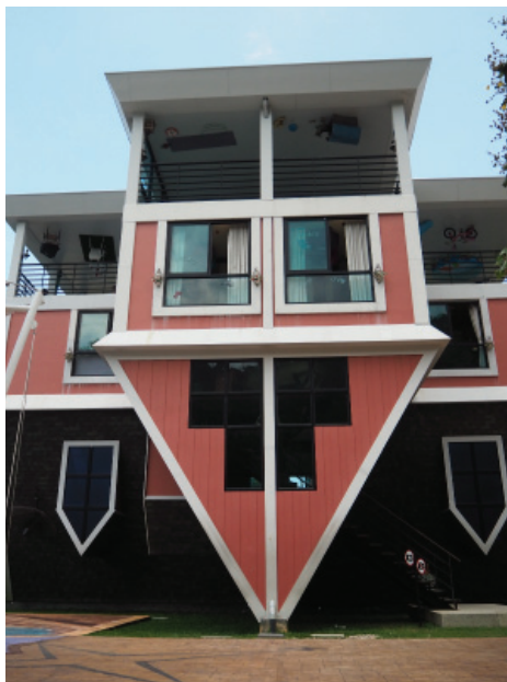
The Upside Down House

is located on Chalerm Phra Kiat Rama IX Road (bypass), called Ban Teelanka in Thai, the pink house standing upside down with funniest attraction for families and friends. Open daily from 10.00 a.m.-18.00 p.m. For more information, please call Tel. 0 7637 6245, 08 4456 5279 www.upsidedownhouse-phuket.com