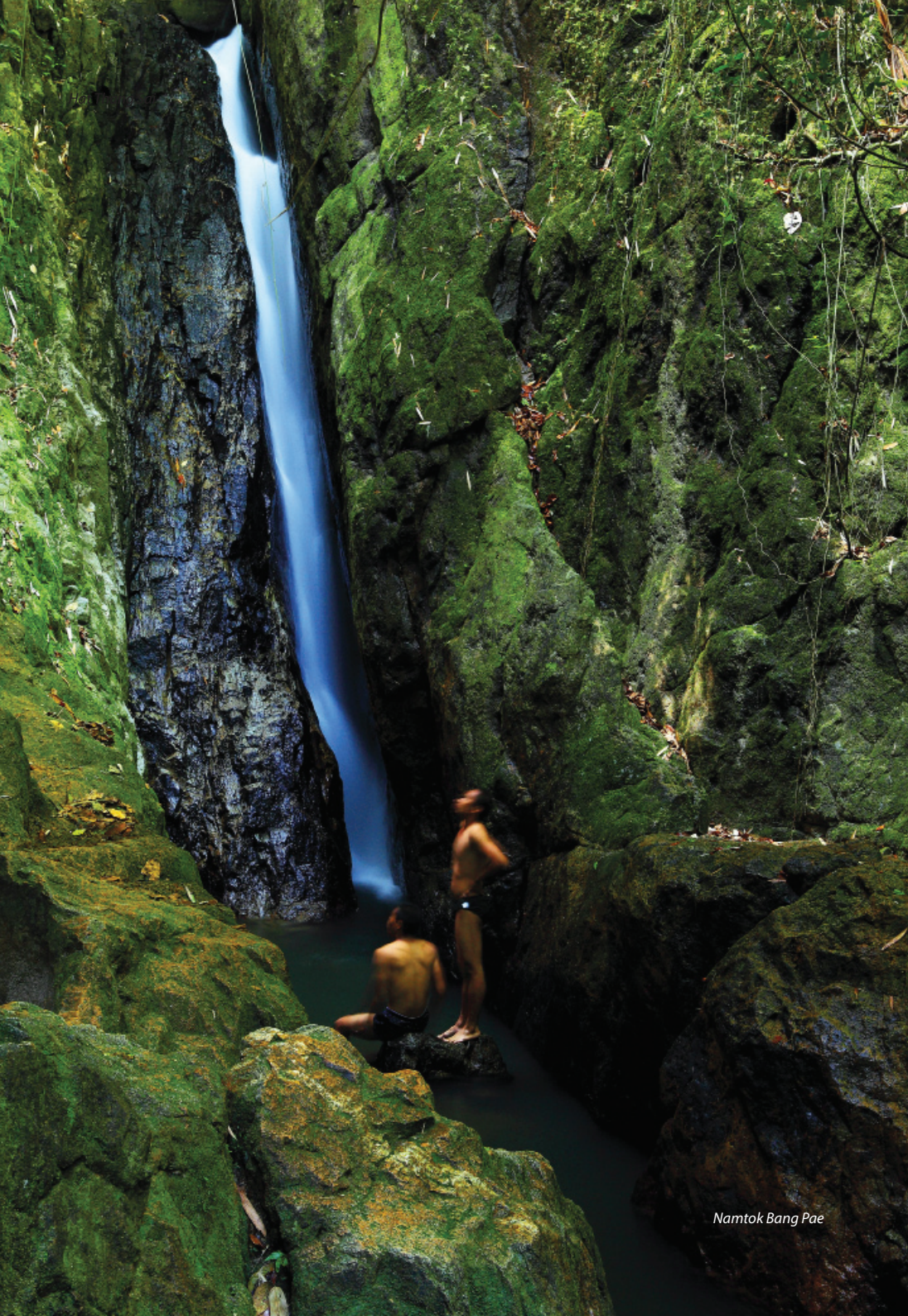
Namtok Bang Pae