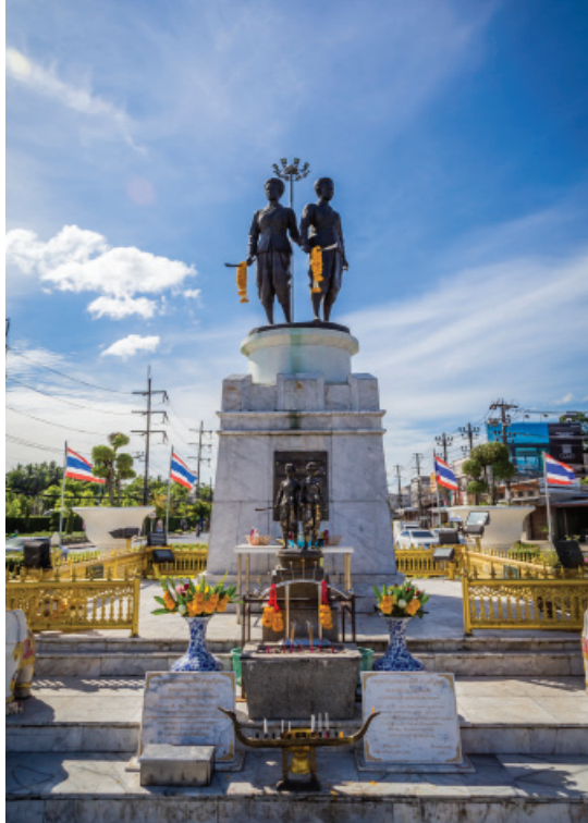
Two Heroines Monument

Thep Krasattri Road, Tambon Si Sunthon , is a learning park of the art, culture, way of life and local traditions of the people of Phuket. “Peranakan” is a Malay term meaning “born here”, which is used for calling the mixed breed Chinese. The Museum replicates the Sino-Portuguese architecture, which is an identity of Phuket, and showcases the Baba-Yaya costumes, and Peranakan accessories. Admission fees: 300 Baht for adults and 150 Baht for children. Open daily between 9.00 a.m.–6.00 p.m. For more information, please call Tel. 0 7631 3556, 0 7631 3031.