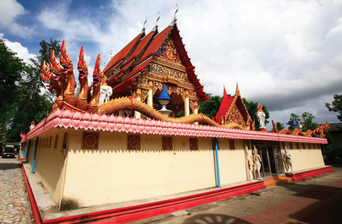
Wat Phranang Sang