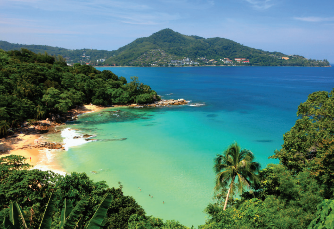
Ko Nakha Yai