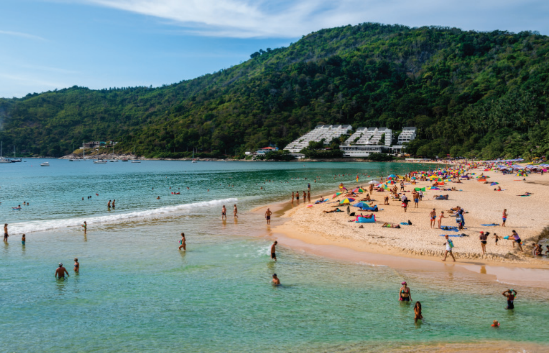
Hat Nai Han

location of the “Kanchanaphisek Lighthouse” to celebrate occasion of the King’s Rama 9 50th anniversary of his accession to the throne.