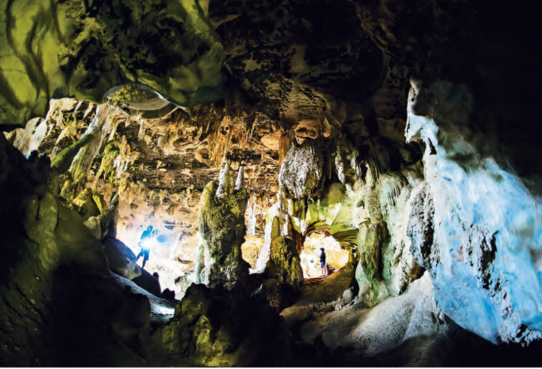
Tham Phi Hua To

can shine through, and on the right is a path to a chamber hall believed to have once been a shelter for cave dwellers. Prehistoric paintings of men, animals, human organs and numerous seashells can be seen in the cave. Big human skulls were also discovered, an origin of the name, "Big-headed Ghost Cave".