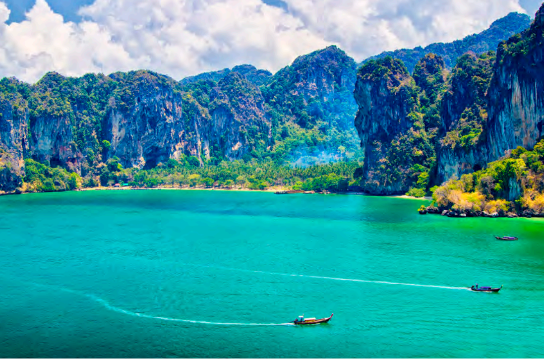
Hat Rai Le