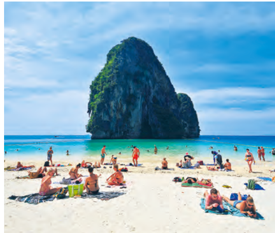
Hat Tham Phra Nang

This is a 3-km. long sandy beach located 6 kms. from Ao Nang. The beach, paved with tiny sea-shells, was formerly called “Hat Khlong Haeng” by locals, which means “dried canal beach”. The