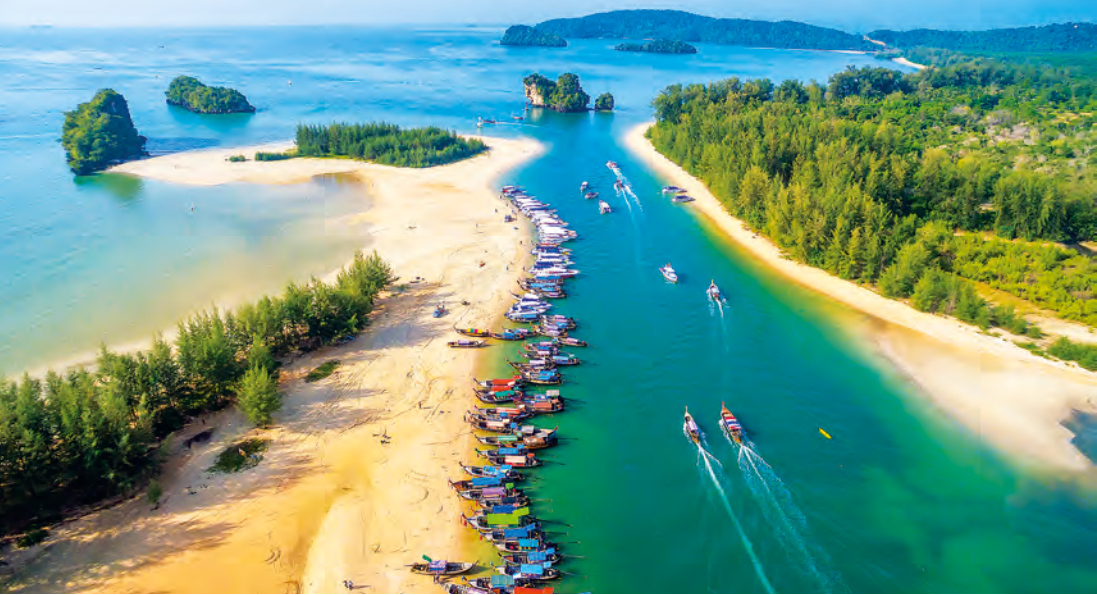
Hat Noppharat Thara

area both onshore and offshore. Visit www.dnp.go.th for more information.