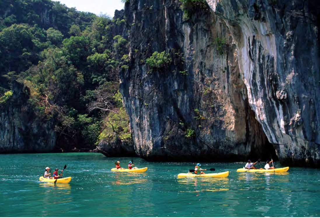
Than Bok Khorani National Park