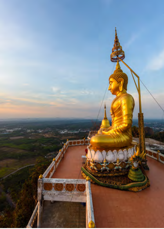
Wat Tham Suea