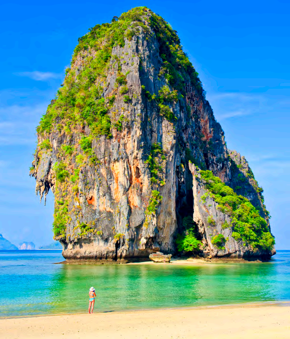
Hat Tham Phra Nang