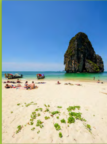
Hat Tham Phra Nang