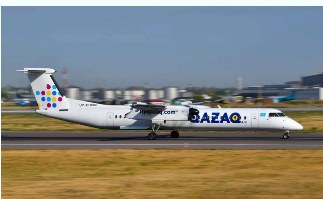
● Qazaq Air Airplane for the Domestic Flights

Similarly, SCAT Airlines' fleet includes Boeing 737 and Bombardier CRJ200 aircraft, while FlyArystan uses Airbus A320 models. Qazaq Air, which serves mainly domestic routes, relies on Bombardier Dash 8-Q400 planes.