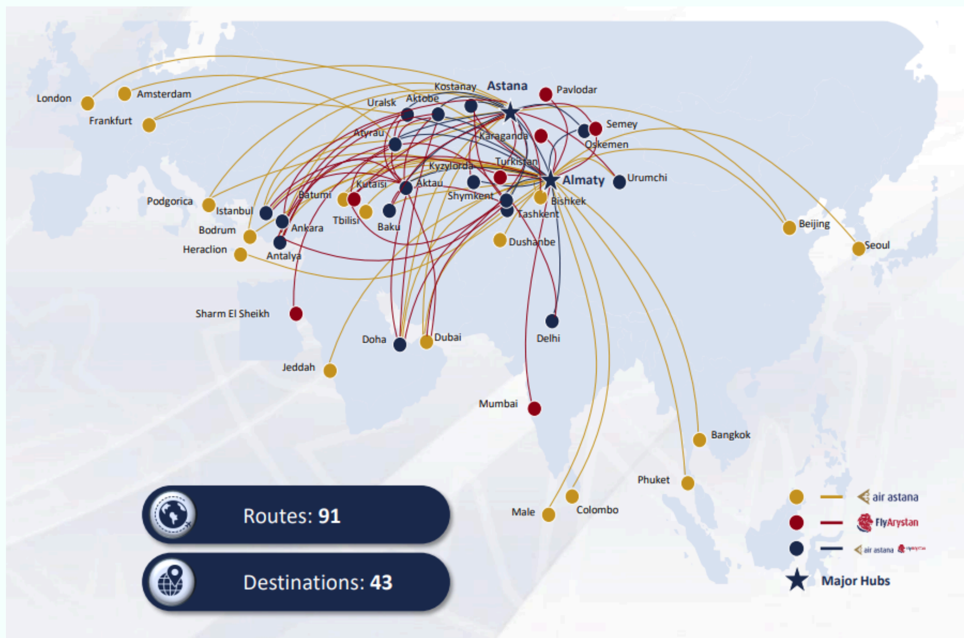
● Air Astana and Fly Arystan Destinations

Particularly, SOVICO Group, a prominent Vietnamese conglomerate, has acquired a substantial stake in Kazakhstan's regional airline, Qazaq Air. The acquisition is expected to enhance Qazaq Air's fleet management, introduce more efficient aircraft, and expand its route network. Furthermore, it opens the door for closer economic ties between Kazakhstan and Vietnam, potentially increasing air traffic between the regions and boosting trade and tourism.