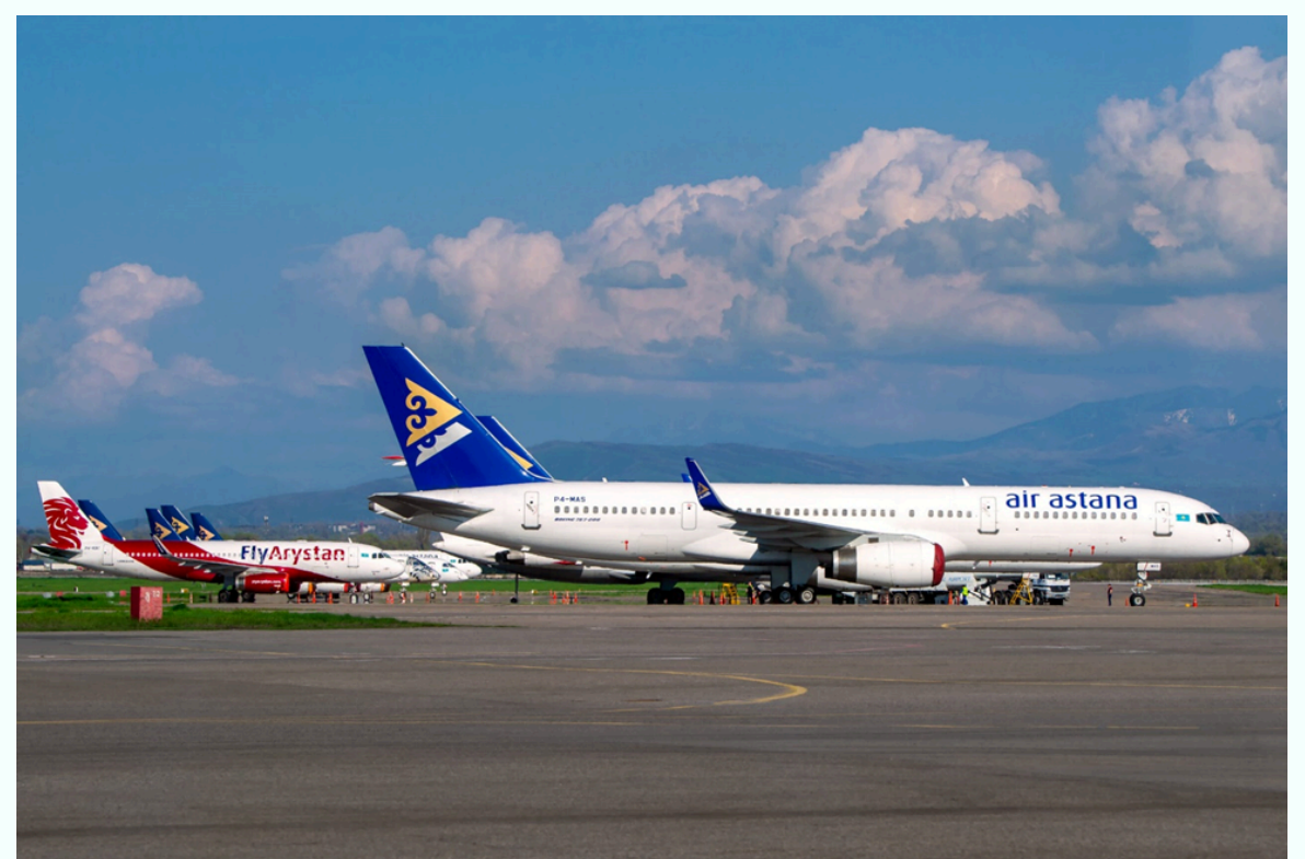
● Air Astana and Fly Arystan airplanes