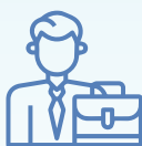
Wealthy Global Citizen

LTR visas will be offered to four categories of foreigners: Global Wealthy Witzens, Wealthy Pensioners, Work-from-Thailand Professionals, and Highly-Skilled Professionals. Spouses and dependents of LTR visa holders will also qualify for the same visas.