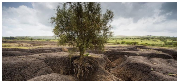
Soil erosion in the Tanzanian Maasai landscape

The rate at which soil is becoming degraded and depleted could very well turn it into the new black gold. While soil formation does occur in nature, the process is so slow that soil may as well be regarded as a non-renewable resource. Consider this – it takes up to 1,000 years to form one centimeter of top soil, but this one centimeter can be lost with just one heavy rainfall. It should not come as a surprise then, that the United Nations has been raising the alarm bells of an impending catastrophe. Ninety per cent of the Earth's precious topsoil is likely to be at risk by 2050. By that year, the impact of soil degradation could have already caused $23 trillion in losses of food, ecosystem services and income worldwide. These are staggering figures.