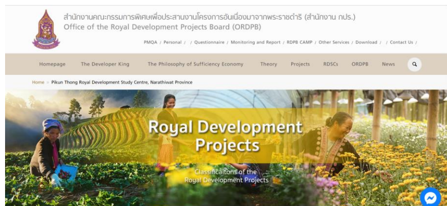
Office of the Royal Development Projects Board website

In 1993, the World Bank presented His Majesty with a specially-commissioned sculpture of a vetiver plant made of bronze, together with an Award of Recognition “for technical and development accomplishment in the promotion of vetiver technology internationally.” As a leader of research in vetiver grass, Thailand was chosen to host the first International Conference on Vetiver (ICV) in 1996 in collaboration with the World Bank and the FAO. Subsequently, the Pacific Rim Vetiver Network with Thailand at the core was established to serve 22 member countries of the Pacific Rim in order to disseminate information on the Vetiver System. To date, member countries have produced over 70,000 publications which are accessible through the website administered by the Office of the Royal Development Projects Board.