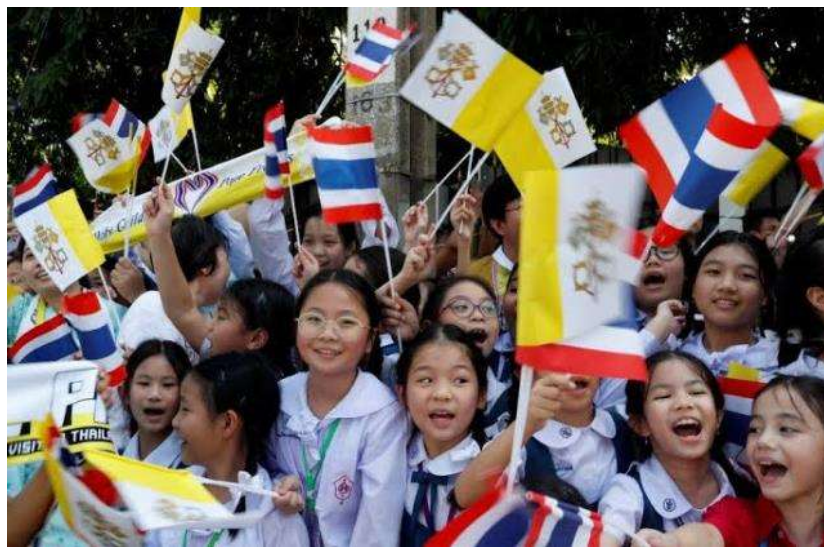
Photo: Thai Catholics gather to welcome the arrival of Pope Francis in Bangkok, November 2019

Almost four decades later, the meeting between the present King and Queen and Pope Francis echoes not only the close bond of friendship cultivated over centuries between Thailand and the Vatican, but also speaks volumes about the monarch's pivotal role as a unifying force and an upholder of all religions in the promotion of interfaith harmony and peaceful coexistence in Thai society.