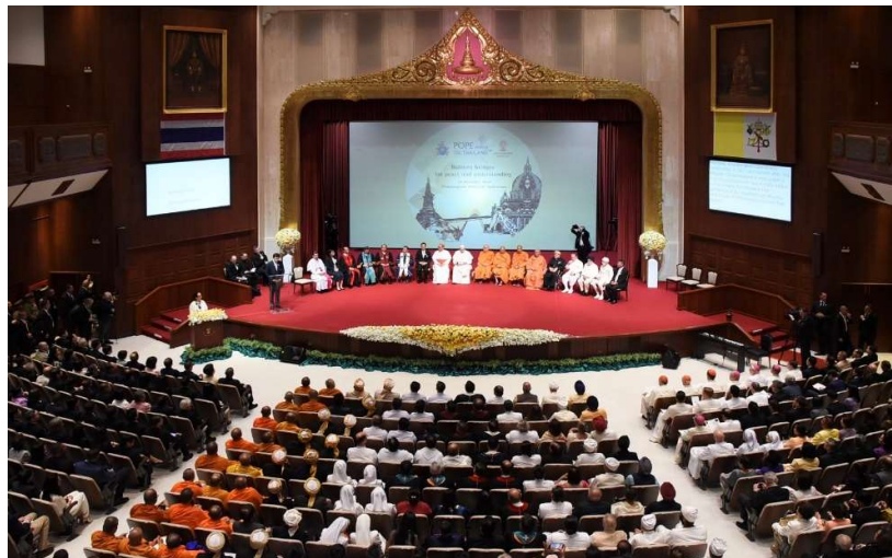
Photo: Pope Francis meets with priests and representatives of different religions at Chulalongkorn University Auditorium

Thailand would not be where it is today if the monarchy did not serve as a pillar of strength and a guiding light, leading by example and wielding incomparable moral authority. The generosity, thoughtfulness and embracing of diversity extended from the sovereign have shaped the nation and countless lives. Following their monarchs, Thais have adopted a mentality of openness and mindfulness of the differences among faiths and religions, and most importantly, a profound respect for those differences. The actions of the monarchy have indeed forged connections, furthered interreligious understanding and demonstrated that, regardless of what faith we hold, we are bound together by goodwill and shared values of kindness and respect.