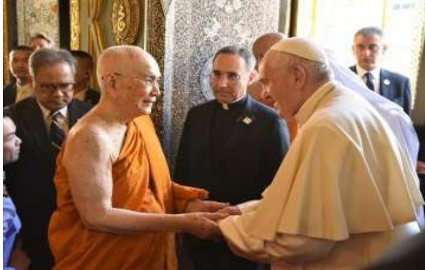
Photo: Pope Francis meets with Somdet Phra Ariyavongsagatayana, Supreme Patriarch of Thailand, at Wat Ratchabophit Sathitmahasimaram