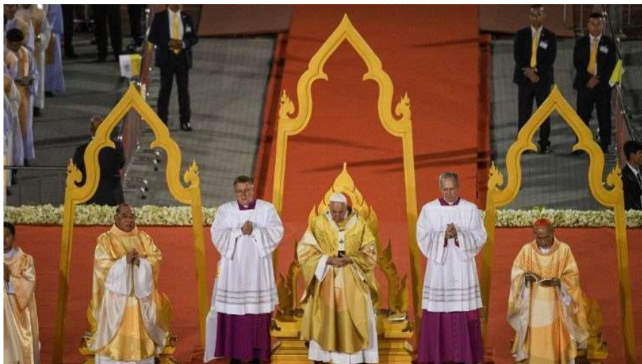
Photo: Pope Francis celebrating his first public mass at the National Stadium in Bangkok in November 2019 (Source: Vatican News website)