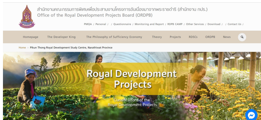
Office of the Royal Development Projects Board website

In 1993, the World Bank presented His Majesty with a specially-commissioned sculpture of a vetiver plant made of bronze, together with an Award of Recognition “for technical and development accomplishment in the promotion of vetiver technology internationally.” As a leader of research in vetiver grass, Thailand was chosen to host the first International Conference on Vetiver (ICV) in 1996 in collaboration with the World Bank and the FAO. Subsequently, the Pacific Rim Vetiver Network with Thailand at the core was established to serve 22 member countries of the Pacific Rim in order to disseminate information on the Vetiver System. To date, member countries have produced over 70,000 publications which are accessible through the website administered by the Office of the Royal Development Projects Board.