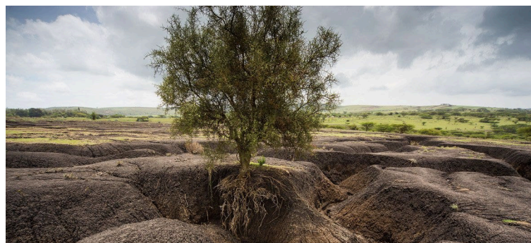
Soil erosion in the Tanzanian Maasai landscape

The rate at which soil is becoming degraded and depleted could very well turn it into the new black gold. While soil formation does occur in nature, the process is so slow that soil may as well be regarded as a non-renewable resource. Consider this – it takes up to 1,000 years to form one centimeter of top soil, but this one centimeter can be lost with just one heavy rainfall. It should not come as a surprise then, that the United Nations has been raising the alarm bells of an impending catastrophe. Ninety per cent of the Earth's precious topsoil is likely to be at risk by 2050. By that year, the impact of soil degradation could have already caused $23 trillion in losses of food, ecosystem services and income worldwide. These are staggering figures.