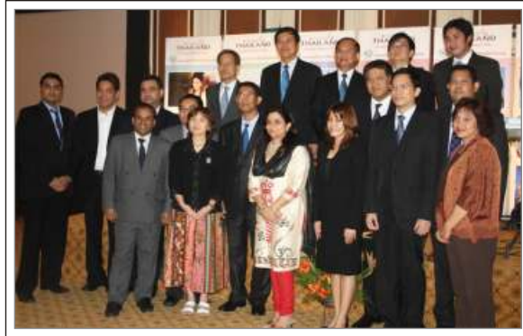
TAT Delegation in Chennai with the Governor.