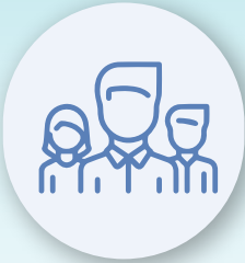
Exemption from 4 Thais to 1 foreigner employment requirement ratio