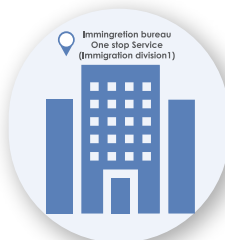
Immigration and work permit facilitation services at One Stop Service Center for Visa and Work Permit