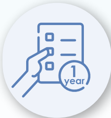
90-day report extended to 1-year report and exemption of re-entry permit