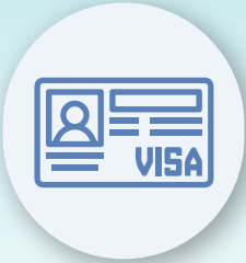
10* years renewable visa

There will be many privileges for LTR visa holders that will make living in Thailand long term easier and less bureaucratic. These privileges include: discounted personal income tax rate, the removal of the requirement for employers to hire four Thai citizens per foreigner, fast track at international airports, 1 year reporting to Immigration instead of 90 days, and the overall ease of regulations concerning foreign residents. The LTR Visa program makes the process of hiring foreigners easier and the foreign experts hired will strengthen the private business sector of Thailand.