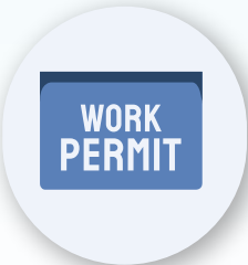
Permission to work in Thailand (Digital Work permit)