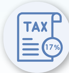
17% Personal income tax for High-skilled professionals