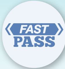
Fast Track Service at International Airports in Thailand