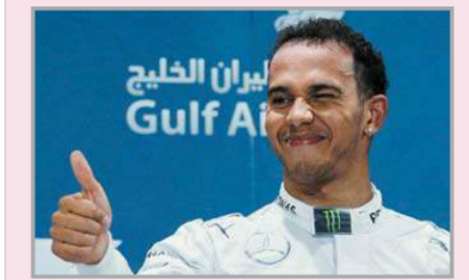
Mercedes AMG Petronas driver Lewis Hamilton celebrates on the podium after winning the Formula One Bahrain Grand Prix at the Sakhir circuit, in Manama, on Sunday. PAGE 33 >