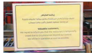
A notice posted by the management announcing closure of a restaurant at Hyatt Plaza, in Doha, on Sunday.

An Asian restaurant in Hyatt Plaza has stopped offering a few items of food that must be cooked on gas such as rice, said a customer. In the nearby Villaggio mall, all the restaurants were seen working normally on Sunday night. Several workers said that they didn't get any notice regarding safety conditions.