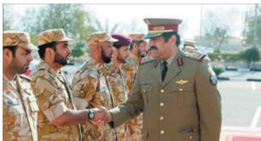
Minister of State for Defence HE Major General Hamad bin Ali Al Attiyah meets recruits of the first batch of the National Service Programme, in Doha, on Sunday.