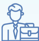
Wealthy Global Citizen

LTR visas will be offered to four categories of foreigners: Wealthy Global Citizens, Wealthy Pensioners, Work-from-Thailand Professionals, and Highly-Skilled Professionals. Spouses and dependents of LTR visa holders will also qualify for the same visas.