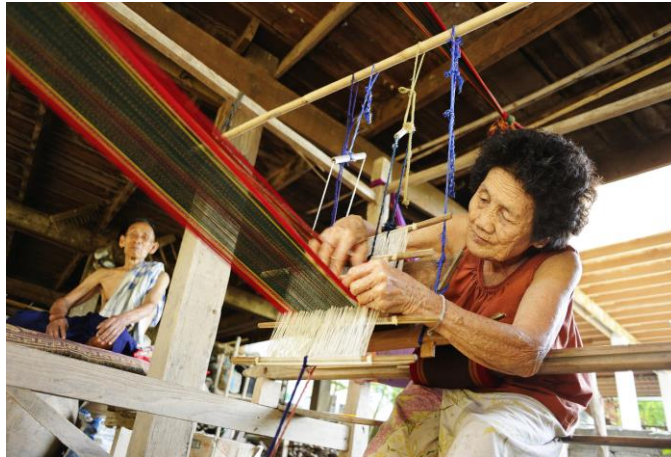
Ban Hat Siew in Sukhothai province, Northern Thailand: a Tai Phuan woman meticulously patterning a “Pha Sinh Teen Chok,” a kind of sarong for ceremonial use.