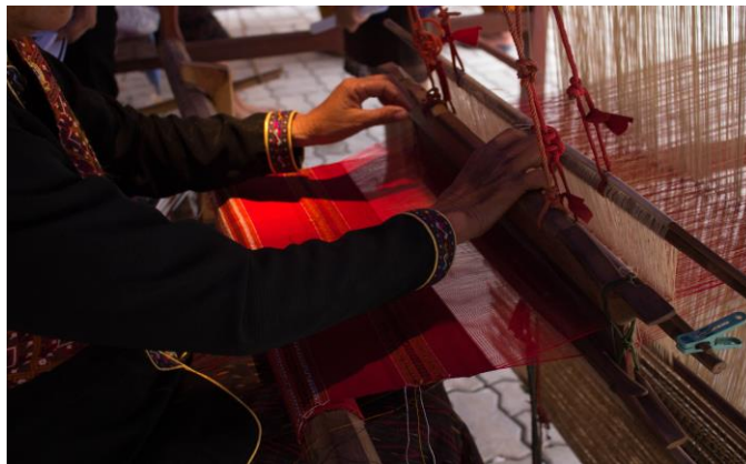
Ban Phon in Kalasin province, Northeastern Thailand: a Phu Tai woman weaving Phrae Wa silk in Kalasin.

The making of artisanal Thai fabrics is also closely associated with nature. For silks, villagers grow mulberry trees and harvest the leaves for feeding silkworms. Leftover waste from growing the silkworms then becomes good quality fertilizer. In contrast to chemical dyes, colors derived from natural sources such as indigo for blue, ebony seeds for grey and black, lac for red, are non-toxic, so they can be discarded without causing harmful pollution. Old traditional techniques therefore, continue to prove better for both the planet and the people.