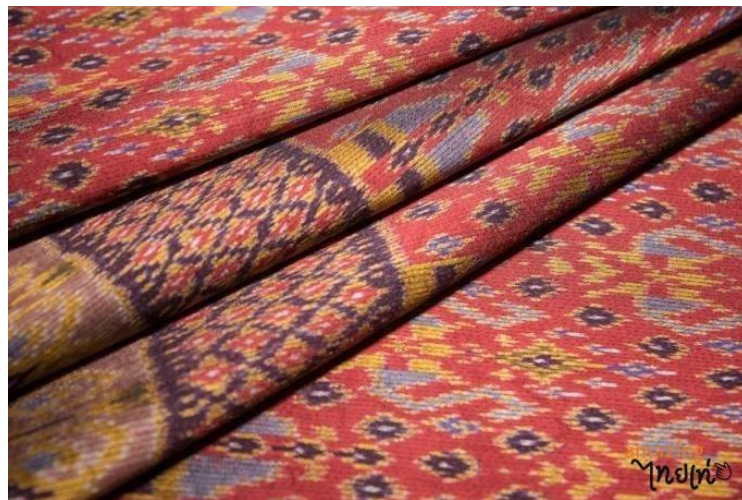
Examples of local mudmee from Baan Hua Fai Village.