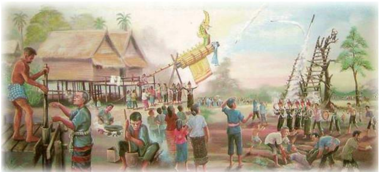
Traditional Boon Bung Fai (Rocket Festival)

For Thailand, agriculture employs one third of the population, and much of this sector depends on the amount of annual rainfall. Thai farmers’ reliance on seasonal precipitation is reflected in several Thai water-based ceremonies. One notable example is the “Boon Bung Fai” festival during which villagers in the northeastern region propel homemade rockets into the sky to please the Rain God and plea for a favourable amount of rainfall.