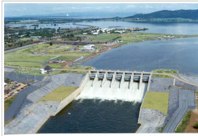
Pasak Jolasid Dam

Onto the mountains represented the reservoirs and irrigation systems initiated by King Bhumibol to ensure year-round availability of water for agriculture and daily usage. They were also employed to alleviate the severity of floods by releasing runoff of excess water “into the oceans” at the appropriate moments. Pasak Jolasid Dam, Thailand’s largest earth-fill dam, is one of His Majesty’s most widely known initiatives to address flood and drought in Pasak River, one of the main tributaries of the Chao Phraya River that encompasses around 352,000 hectares of farmland, including in Greater Bangkok and its adjacent areas. It was designed to collect and store surplus water from the upper reaches of the river during the rainy season as well as to reduce the likelihood of flooding in the lower parts.