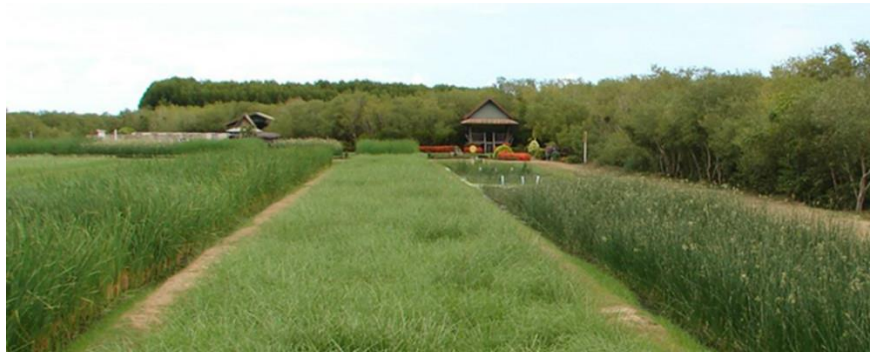
Hub Kapong Royal Project Learning Centre

His Majesty then decided to set aside 1,932 hectares of degraded forest in the area for rehabilitation.