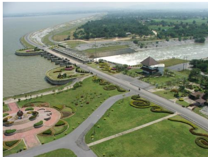
Pasak Jolasid Dam