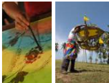
Urban & Cultural Heritage Tourism