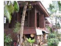
Homestay / Kampung Stay Program