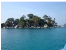
Sustainable Island Tourism