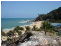
Mainland Coastal Tourism