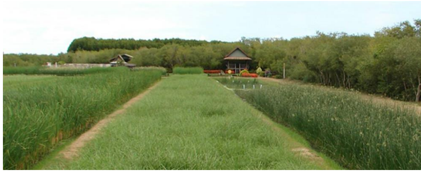
Hub Kapong Royal Project Learning Centre

His Majesty then decided to set aside 1,932 hectares of degraded forest in the area for rehabilitation.