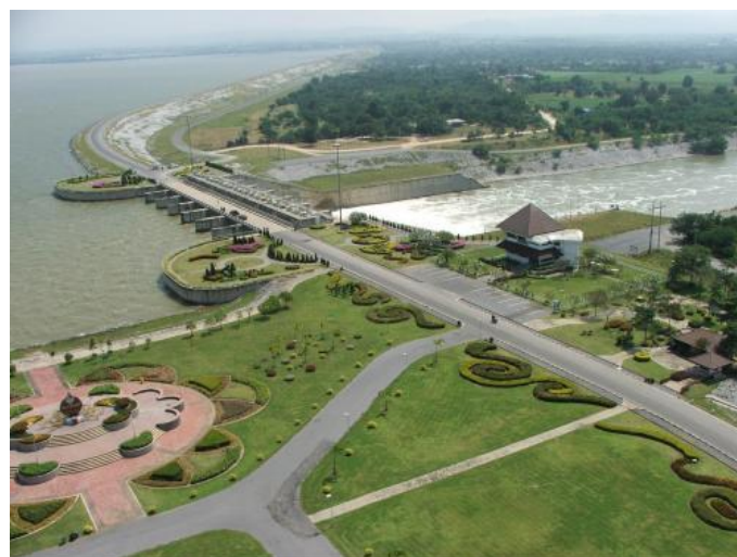
Pasak Jolasid Dam