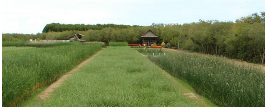
Hub Kapong Royal Project Learning Centre