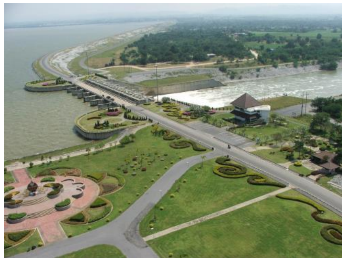
Pasak Jolasid Dam