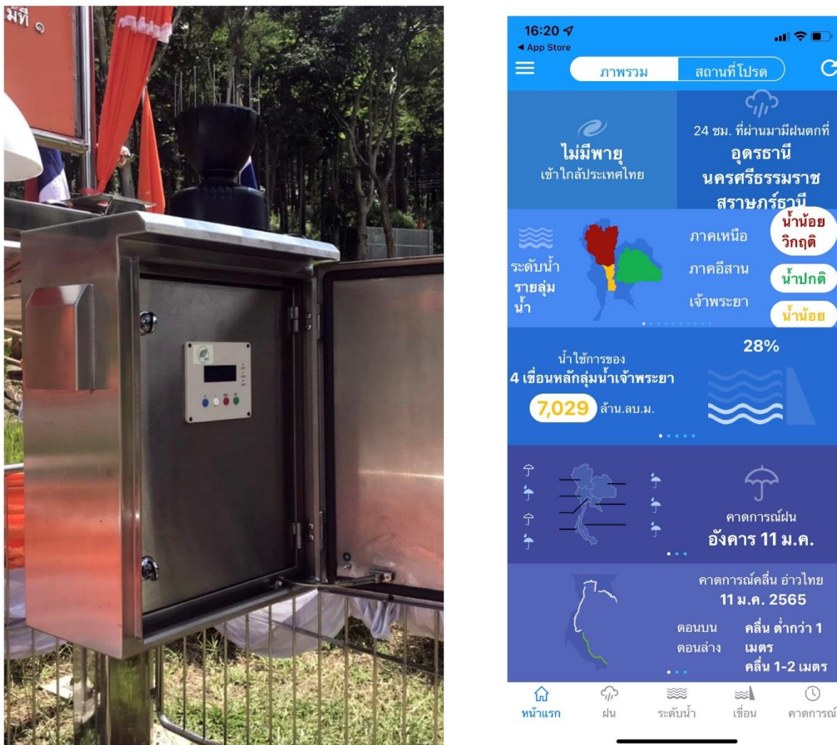
Photo: (from left to right) Automated Telemetry Station in Pongyeang sub-district, Mae Rim District, Chiang Mai Province and interface of ThaiWater mobile-application that has been integrated for general use.