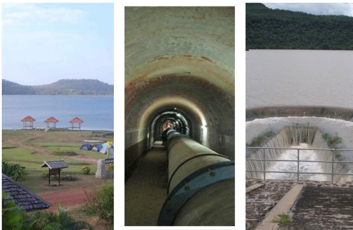
Photo: (from left to right) Huai Pai Reservoir in Mukdahan, water delivery system, and Lam Payang Reservoir in Kalasin.