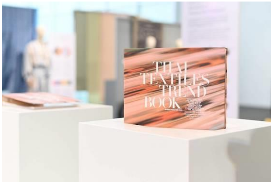
Book launch event: “Thai Textiles Trend Book SS 2022”

The next phase in the growth trajectory of traditional Thai fashion is for it to truly “go global”. In the footsteps of her grandmother, Her Royal Highness Princess Sirivannavari Nariratana spearheaded the creation of the Thai Textiles Trend Book. As the Editor in Chief, Princess Sirivannavari oversaw the compilation of “Thai tones” as well as patterns and material that would make traditional Thai textiles marketable beyond Thailand. Made available for free in both print and electronic version on the Ministry of Culture website, the Trend Book offers ready references for weavers, designers, students and anyone developing new ideas for Thai textiles.