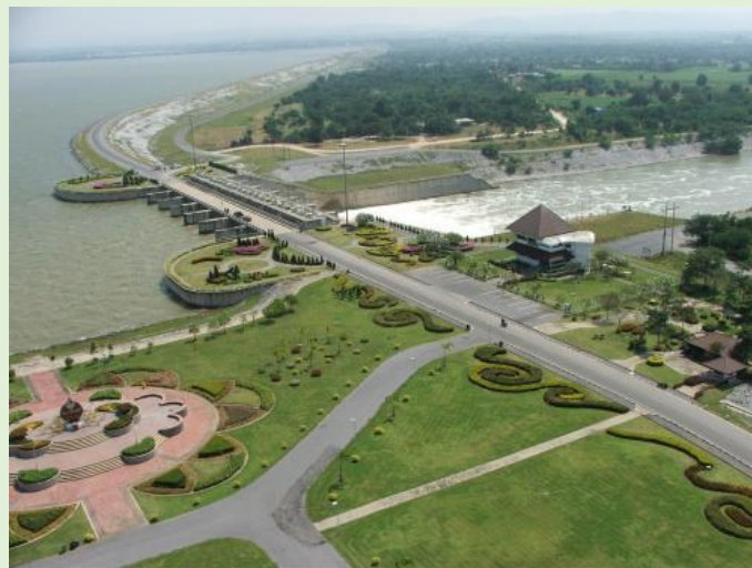
Pasak Jolasid Dam