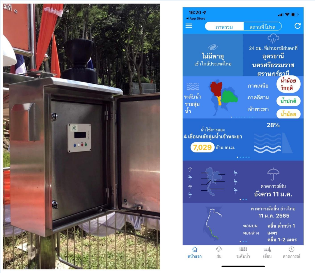
Photo: (from left to right) Automated Telemetry Station in Pongyeang sub-district, Mae Rim District, Chiang Mai Province and interface of ThaiWater mobile-application that has been integrated for general use.

To this day, the lifeline of the people continues to occupy an important place in the work of the Thai monarchy, as out of 4,877 Royal Development Projects, nearly 70% of them, or 3,386, are water resource development projects.