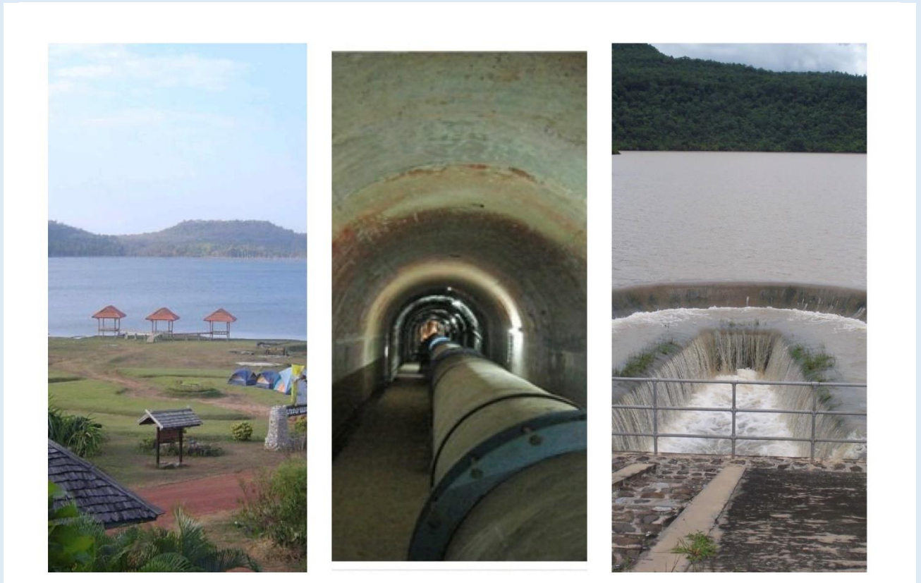
Photo: (from left to right) Huai Pai Reservoir in Mukdahan, water delivery system, and Lam Payang Reservoir in Kalasin.

In the North, the King focused on preserving watershed areas and creating check dams, such as the Mae Kuang Udom Thara Dam in Chiang Mai. In the northeast, the work was concentrated more on setting up a water network system, such as the 740-meter long water delivery system that siphons water from Huai Pai Reservoir in Mukdahan to Lam Payang Reservoir in Kalasin. This project benefited 736 hectares of irrigable area, increased glutinous rice production from 270 kilogrammes per rai to 480 kilogrammes per rai and made year-round farming possible. In the south, projects such as the Bang Nara River Basin Development in Narathiwat effectively addressed the problem of drought, flood, saline, and acidic water.