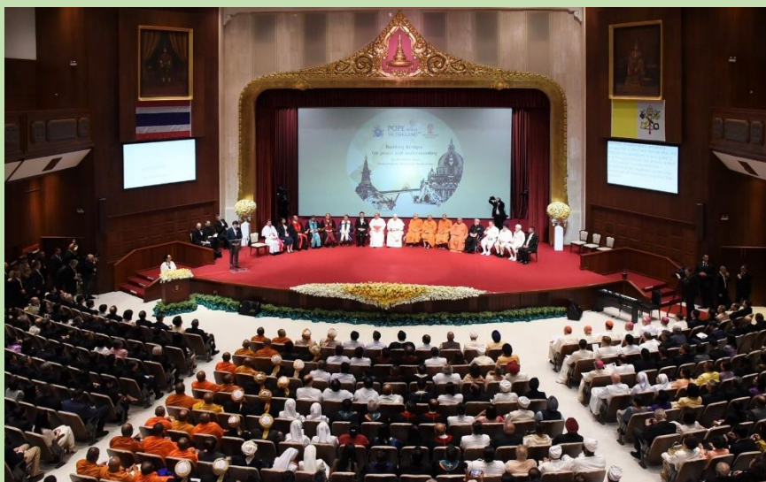
Photo: Pope Francis meets with priests and representatives of different religions at Chulalongkorn University Auditorium